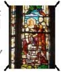
6. Samaritan Woman at the Well FUNDS ALREADY DO- NATED for this Window