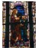
4. Calling of Matthew