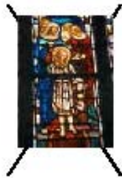
2. Jesus in the Temple FUNDS ALREADY DONATED for this Window