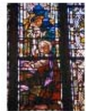
8. Garden of Gethsemene