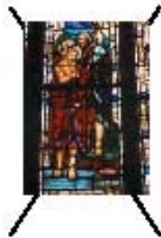
3. Baptism of Jesus FUNDS ALREADY DONATED for this Window