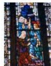
10. He is Risen