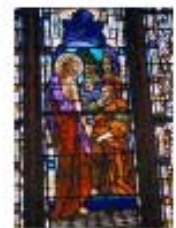
9. Jesus facing Pontius Pilate