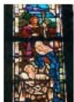
1. Birth of Jesus