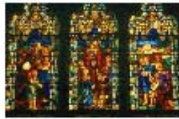
5. Jesus Blessing the Children