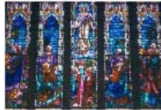
Ascension Window (rear of sanctuary)